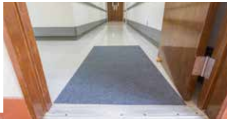
Place at transition areas to mitigate tracking dirt to front of house