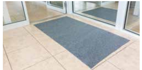
Great entry/exit matting that will not move or shift under shopping carts