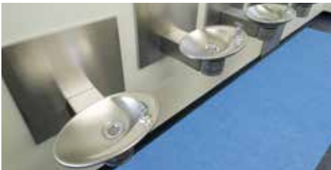
Protect from slipping and falling near sinks and drinking fountains