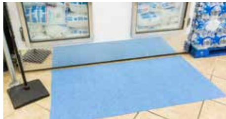
Adhesive strength will not diminish even when wet