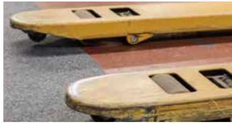
Stays put in warehouses and plant floors in heavy forklift, pallet jack, and foot traffic