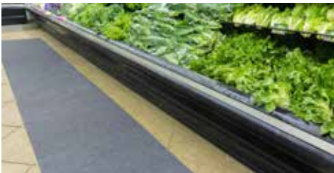
A fast-drying solution in areas where water and moisture can drip or accumulate