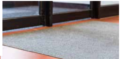
Replace costly rental mat services with an inexpensive and disposable option