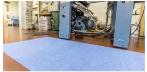
Use near machinery to avoid employee slips, trips, and falls