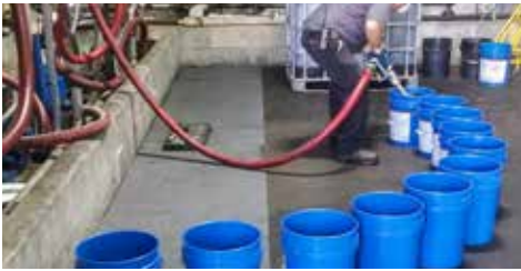
Matting absorbs both oil- and water-based liquids to keep your workplace clean